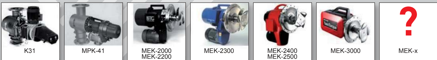
MEK-generations cavalcade from 1965 to 2021 and further.

The MEK is now the highest selling consistency transmitter globally, with more than 40,000 units sold worldwide. For many of our customers, MEK has become synonymous with BTG, many customers call it the "BTG" meter. Each MEK can continue to be operational for many years thanks to routine maintenance. This makes a major contribution to our parts and service business.